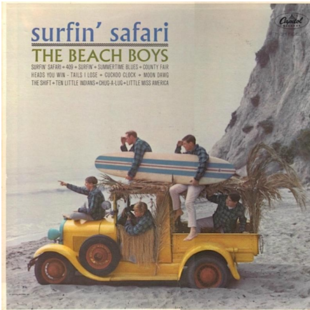
Surfin' Safari by The Beach Boys, 1962