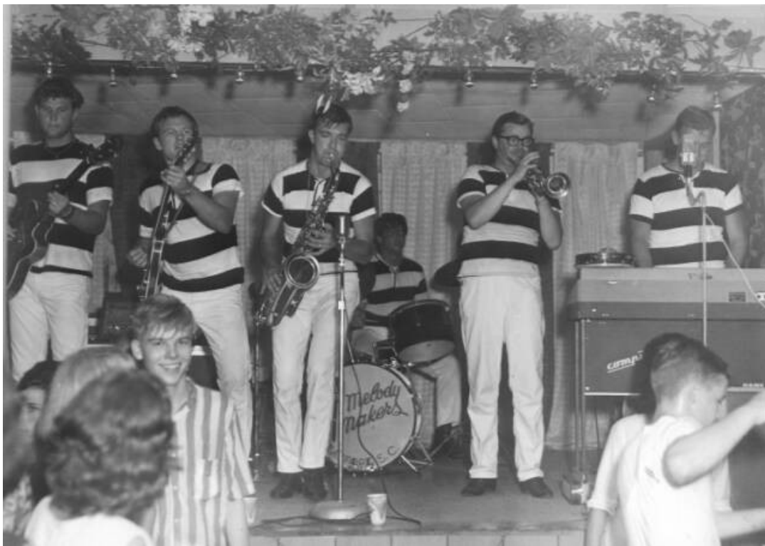
Melody Makers, 1967